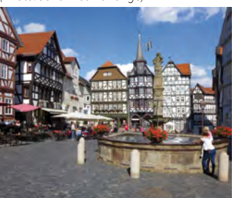
Grünberg, Market Place

Fritzlar, Market Place