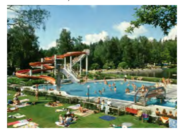
Seifhennersdorf, Wald- und Erlebnisbad

(Tel.: +49 (0) 3586 405040) bad@seifhennersdorf.de