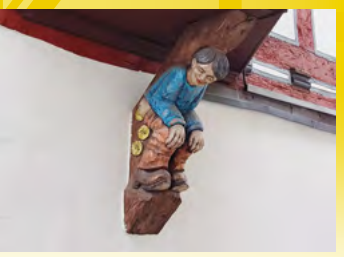
Herborn, Schatzhaus Museum, Hauptstraße

Stadtmarketing Herborn GmbH Bahnhofsplatz 1 Fel.: +49 (0) 2772 708-1900