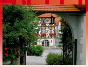
Trochtelfingen, View of the 'Zum Ochsen' Inn