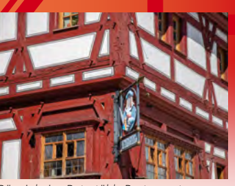
Bönnigheim, Ratsstüble Restaurant