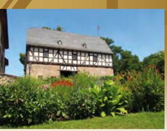
Homberg (Ohm), St. Georg castle chapel