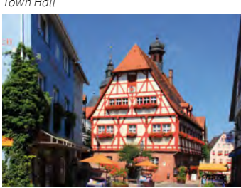
Walldürn, View of the Historical Town Hall