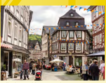
Dillenburg, Old Town, pedestrian zone