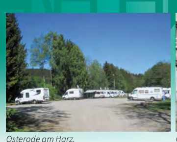
Camping site Eulenburg