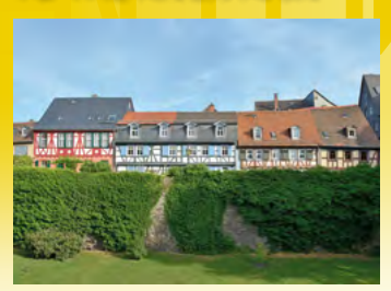
Frankfurt-Höchst, Town View