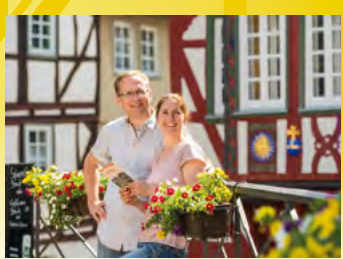
Wetzlar, tourists at the Corn Market