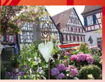
Kirchheim unter Teck

Herrenberg local authority Marktplatz 5 Tel.: +49 (0) 7032 924-0 Fax: +49 (0) 7032 924-390