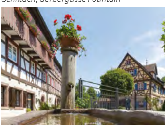
Schiltach, Museum on the Market