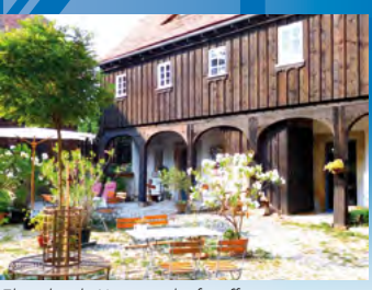
Ebersbach-Neugersdorf, coffee museum, view of the courtyard

City Administration Ebersbach-Neugersdorf Reichsstraße 1 Tel.: +49 (0) 3586 763107 Fax: +49 (0) 3586 763190