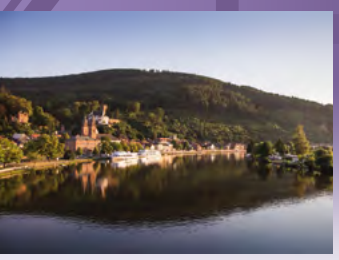
Miltenberg, View of Miltenberg

Tourism association Miltenberg Bürgstadt Kleinheubach Engelplatz 69 Tel.: +49 (0) 9371 404119 Fax: +49 (0) 9371 9488944