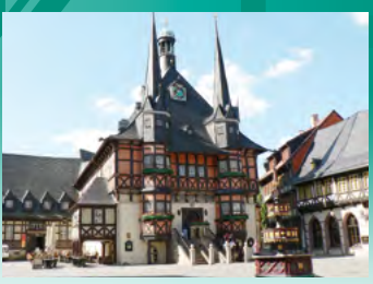
Wernigerode, Town Hall

Stadthagen local authority Tourist Information/i-Punkt Am Markt 1