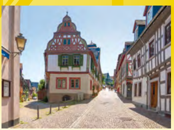
Idstein, Obergasse

Tourist Info Idstein König-Adolf-Platz Tel.: +49 (0) 6126 78-62 Fax: +49 (0) 6126 78-86: