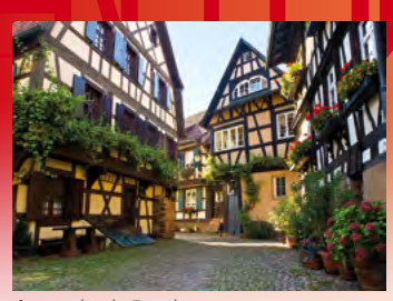
Gengenbach, Engelgasse