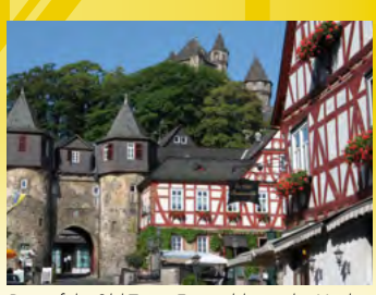
Braunfels, Old Town Ensemble on the Market Place