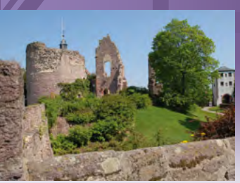
Dreieich local authority, Hayn Dreieichenhain Castle

Dreieich local authority Hauptstraße 45 Tel.: +49 (0) 6103 601-681 Fax: +49 (0) 6103 601-8681