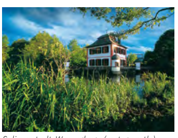
Seligenstadt, Wasserburg (water castle)

Tourist Information Hauptstraße 27 tel.: +49 (0) 6282 67-105 Fax: +49 (0) 6282 67-199