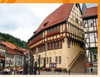
Südharz OT Stolberg, Town Hall