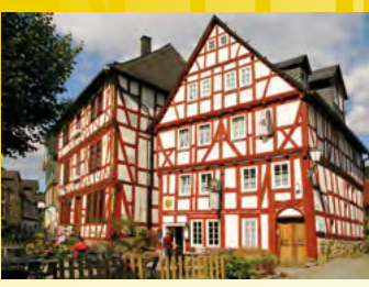
Dillenburg, Hüttenplatz, Schwarzer Adler Inn