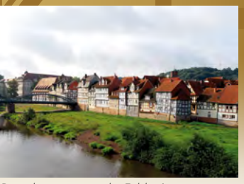
Rotenburg, area at the Fulda river